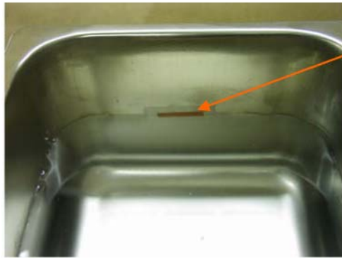
Maximum water level